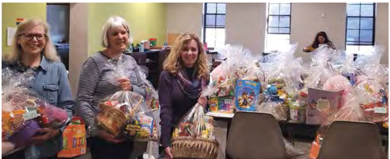
First Presbyterian Church in Allentown put together, donated and delivered 40 wonderful Easter baskets for our youth in kinship care.

(Brian is currently living with a family with the expectation of being adopted.)